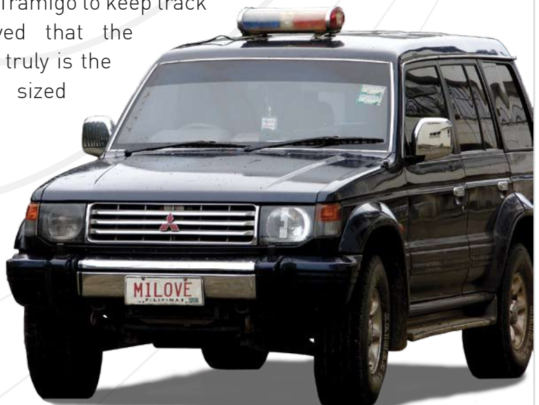
This vehicle, used to transport the city's V.I.P. guests is now one of the vehicles now tracked by patrol 117.

Traditionally vehicle tracking has required large investments and elaborate server based setups that are beyond the budgets of municipalities that do not have thousands of vehicles to track. Tramigo takes advantage of the infrastructure already present in the city by communicating location via the GSM network and the M1 fleet tracking software comes free of charge without monthly or annual licence fees.