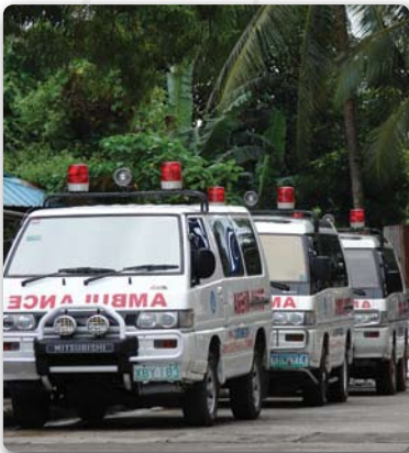
Inspired by the success, the municipality is now preparing to expand vehicle tracking to include all public vehicles, including firetrucks, ambulances, police cars and maintenance vehicles.

With V.I.P. security under control, Mayor Hegedorn now wants to expand the project later this year to all city vehicles, allowing the Patrol Center to monitor unauthorized side trips with the new breadcrumb trail feature of M1 fleet as well as guide local law enforcement and rescue vehicles to their destinations.