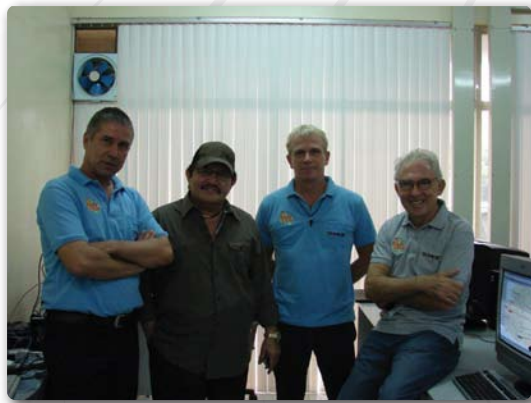
Mayor Hegedorn with the Tramigo team.

Date: December 2008 Country: Philippines City: Puerto Princesa Area: 2,400 km 2 Population: 210,508, Density: 67/km 2