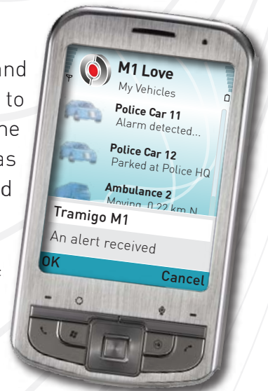
With free Tramigo M1 Love software, top chiefs get instantly information of incidents to their mobile phones, any time, any where.

Future expansions on the number of vehicles tracked by Patrol 117 will be easy to implement as one PC with M1 fleet can track all the vehicles of a small municipality. For the people of Puerto Princesa, the tracking solutions provided by Tramigo may well one day prove to be lifesaving!