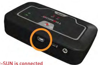
T22-SUN is connected to the T22 unit via USB cable.

Battery charger for T22 portable in outdoor use.