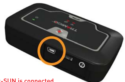
T22-SUN is connected to the T22 unit via USB cable.

Battery charger for T22 portable in outdoor use.