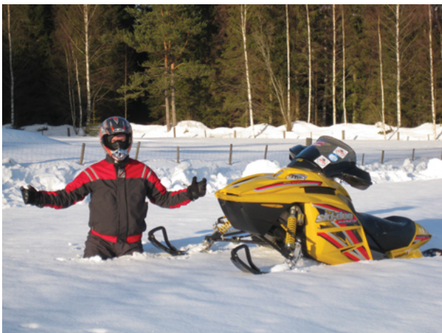
1 meter of snow and stuck but where?

Tramigo T22 unit installed in rear compartment allows tracking and localization of snowmobile and rider in case of emergency, break-down or getting lost in the wilderness.