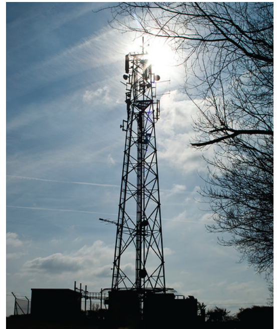
Cellphone base station is the most vital part of communications network

This is one of the many innovative ways that Tramigo T22 devices can be used. There are already hundreds of different applications where client are trusting Tramigo products, ways of usage range from personal safety to